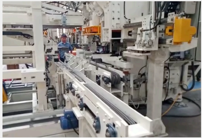
Feeder Hot Punch