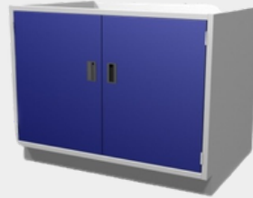
0 01 016