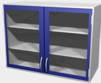
0 01 018