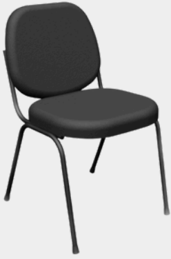
0 06 001