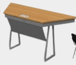
1 05 032 B