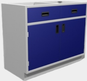
0 01 017