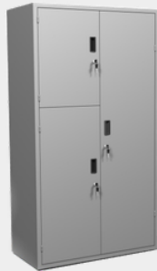
0 02 022