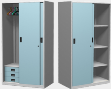
0 02 020