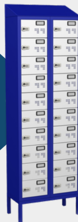
0 03 009