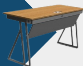
1 05 032 A