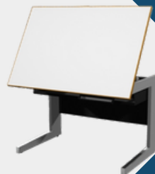
1 05 017