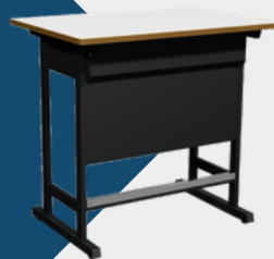
1 05 014