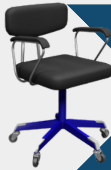
0 06 006