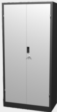
0 02 009