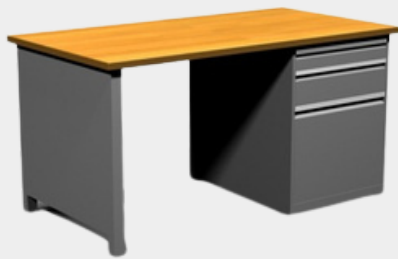
1 05 001