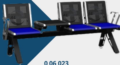
0 06 023