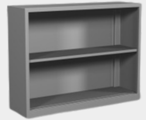
0 02 017