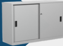
1 01 013