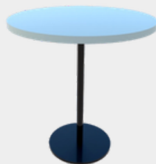
0 05 026