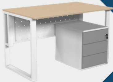
1 05 004 ( Optional Cabinet )