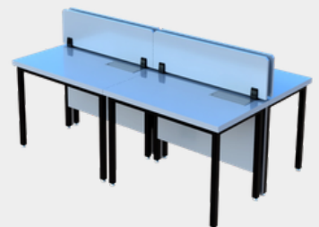
1 05 028