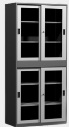
1 02 002