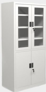
0 02 008