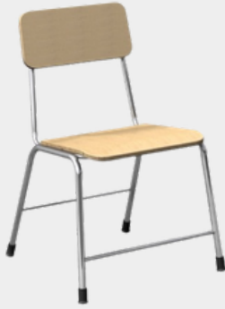
0 06 015