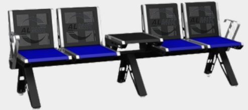
0 06 024