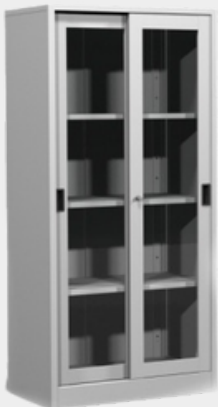
0 02 007