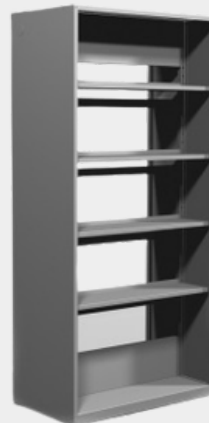
1 02 001