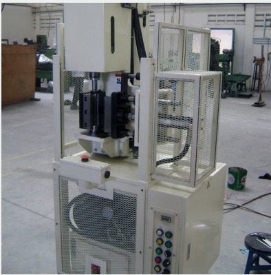
Hydraulic Pipe Expanding MC