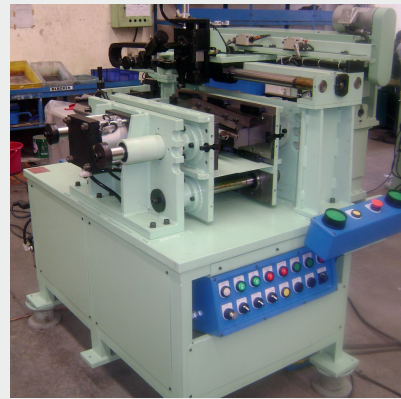
Special tube TIG Welding