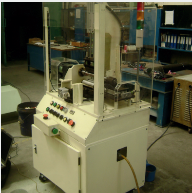
Catalyst Roll SUS Wool