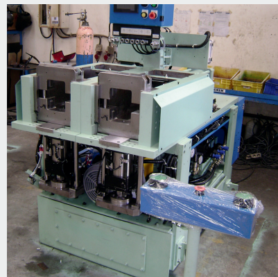
Hydraulic Pipe Expanding / Swaging MC