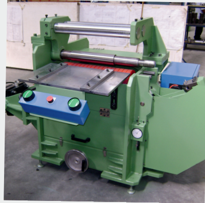
Plate Rolling MC (Straight)