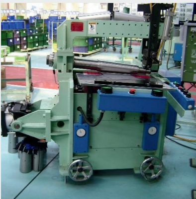
Plate Rolling MC (Straight)