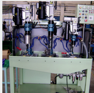
Auto Drill and Tapping MC