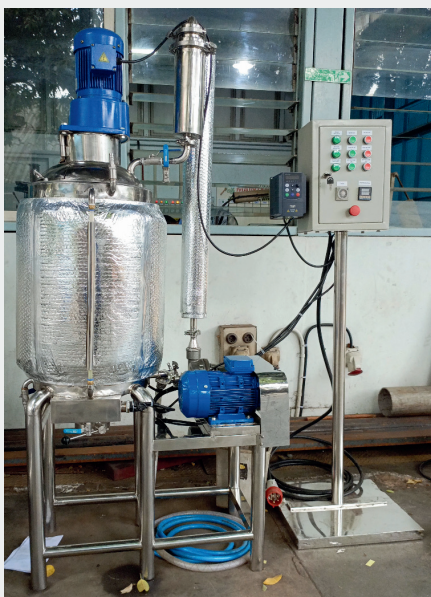
Lithium Carbonate Precipitation Reactor