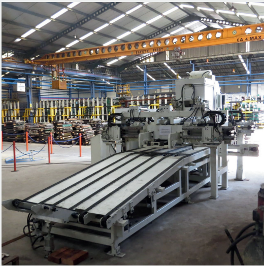
Hot Punch 80 Ton